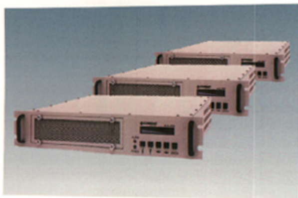
COMSAT Laboratories' link accelerators.